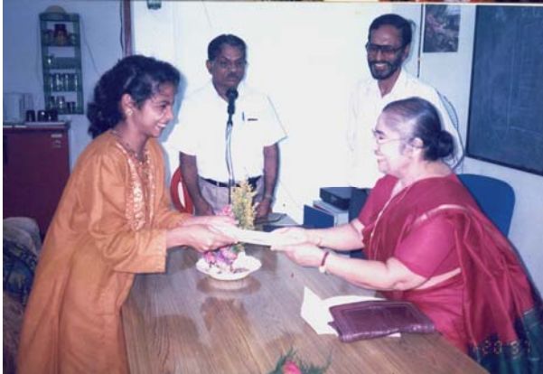
A trainee of NiKITOA was receiving a certificate