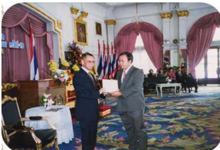
Ceremony at the Government House, 18 December 2001

In the evening of one day in October 2001, I got that good news that FarmPhun had been granted a prize as a good website for young people from the National Youth Bureau, the Office of the Prime Minister. (Now, it has been promoted to be the National Council for Child and Youth Development (NYCD) under the Royal Patronage of HRH Princess Mahachakri Sirindhorn). The day I received the award from the Deputy Prime Minister at Government House, I was very proud and happy.